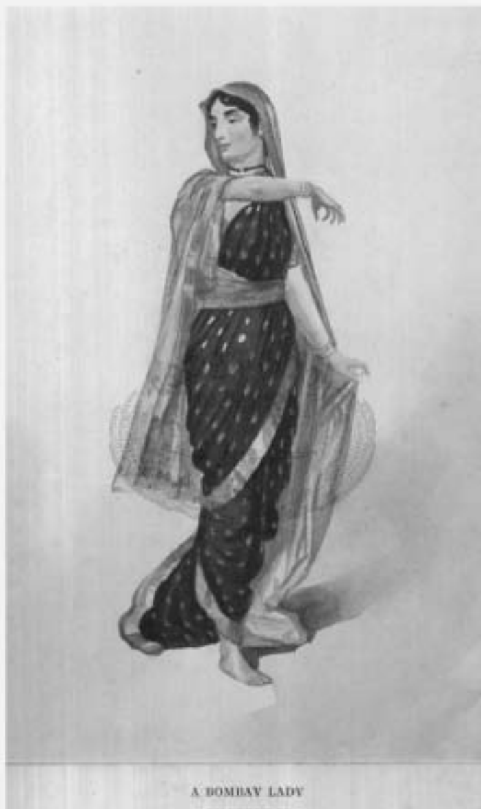
A BOMBAY LADY